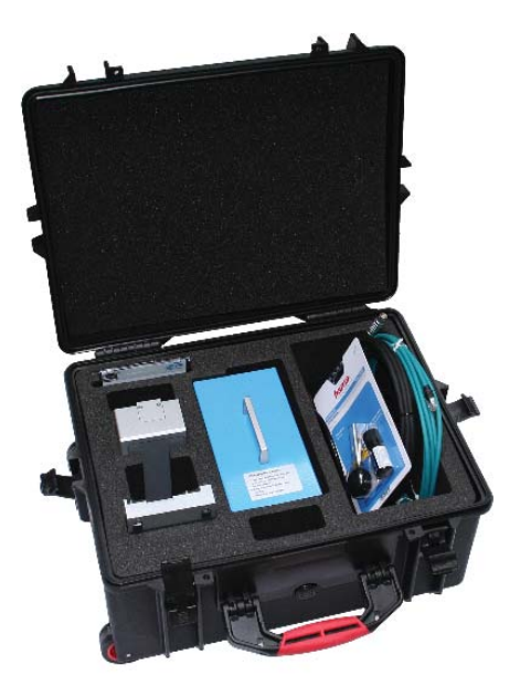
The hard case ensures the safe storage of the accessories

Every Z+F laser scanner is delivered with an accessory case that includes the following items: