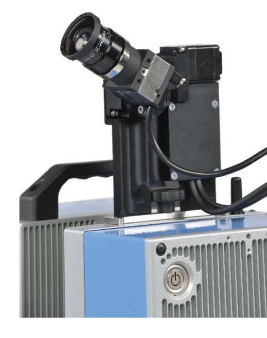
The M-Cam can be mounted effortlessly

Detailed descriptions about numerous additional accessories are available at www.zf-laser.com.