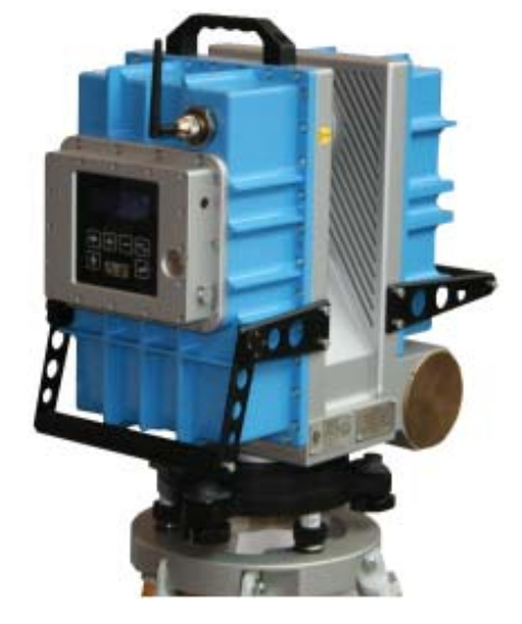
Explosion proof: IMAGER 5006EX

Apart from the Z+F IMAGER for 3D laser scanning, other devices were developed as well. The Z+F PRO-FILER, a 2D laser measuring device for kinematic applications use, appeared on the market in 2002. These instruments are designed for the use on mobile platforms such as railway or road vehicles. The development stages of the PROFI-LER are identical to those of the Z+F IMAGER.